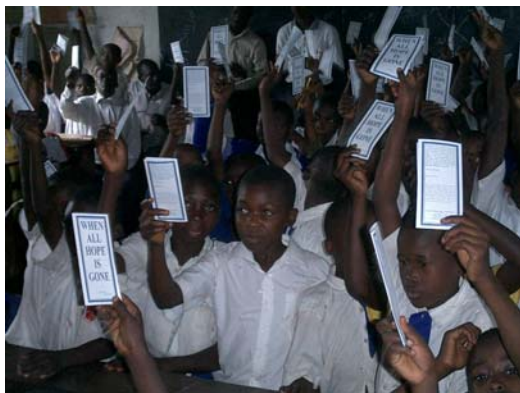
Above: School children receive tract "When All Hope Is Gone" Below: Women prisoners receive blankets from GIMI.

In addition, we have many Bible resources on our web site. We would love to have you using these in your home, your church, or individually to help you grow in the Lord. Just go to our web site and look under my name for "Resources".