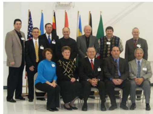
Our GIMI Board of Directors