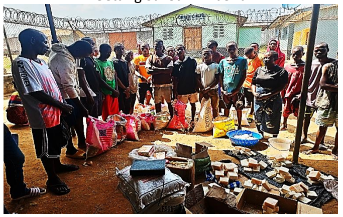
Many Gifts For Prisoners In Liberia For Christmas From GIMI