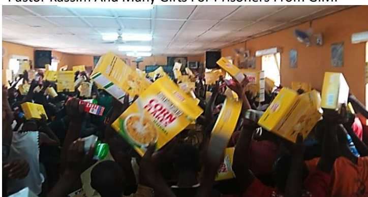
More Corn Flakes For Prisoners In Sierra Leone From GIMI