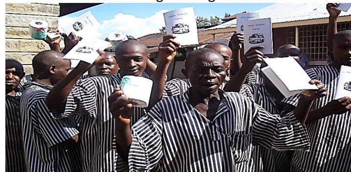
Bible Booklets And Toilet Tissues For Kenya Prisoners