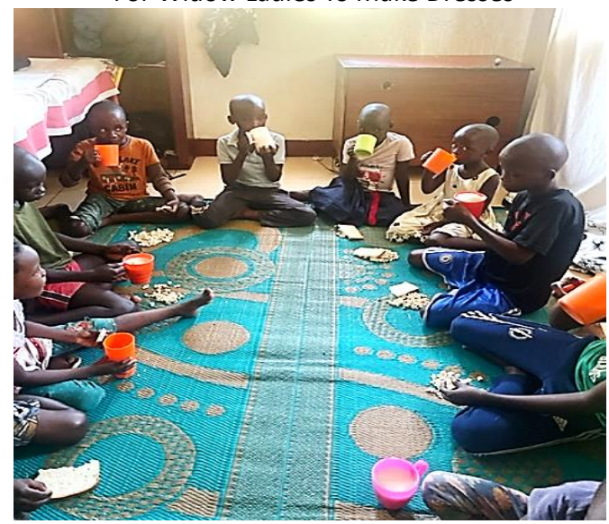
GIMI Feeding Many Orphans In The DRC