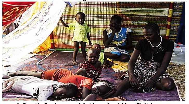
A South Sudanese Mother And Her Children Waiting For Food