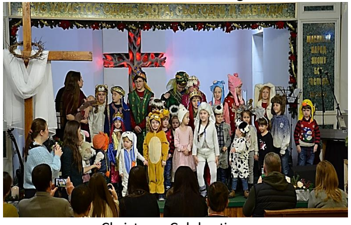
Christmas Celebration At Grace Church In The Ukraine