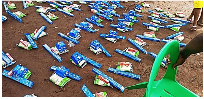
Christmas Gifts For Prisoners In Lugazi Prison In Uganda