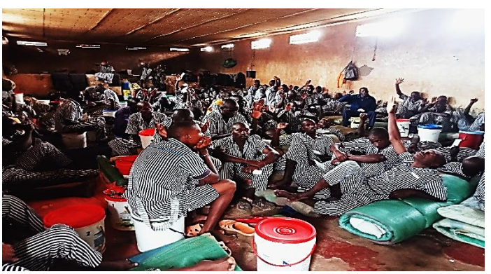
Kenya Prisoners Praying To Receive Christ In A Terrible Kenya Prison