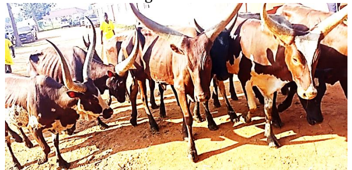
Cows On The Way to Christmas Dinner In Uganda Prisoners