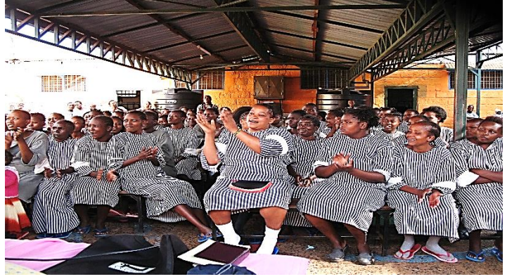
Kenya Lady Prisoners Singing To Praise Jesus For His Blessings