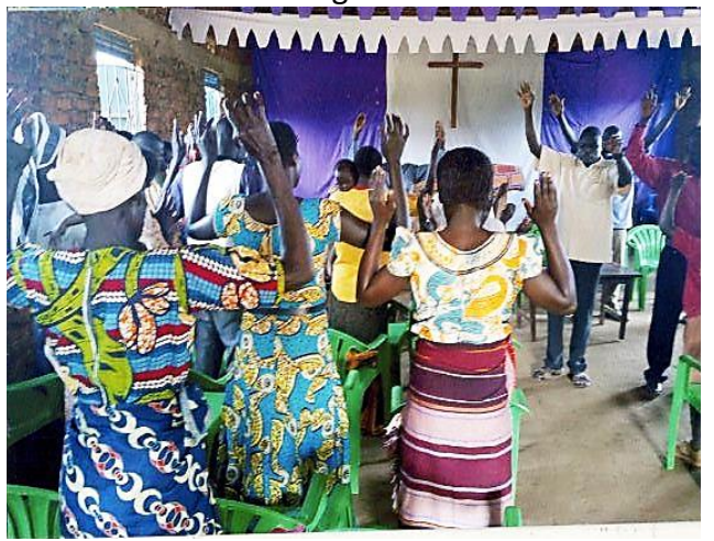
More Refugees Praying To Receive Jesus In A Makeshift Church Building