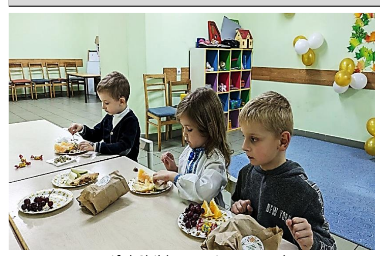
Beautiful Children Eating A Meal In Grace Church During The War