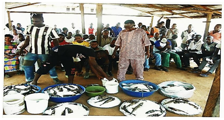
A Special Christmas Fish Dinner For Prisoners In Cameroon