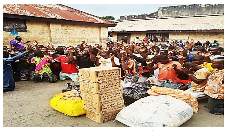
Prisoners Getting Saved At The Christmas Evangelism Service