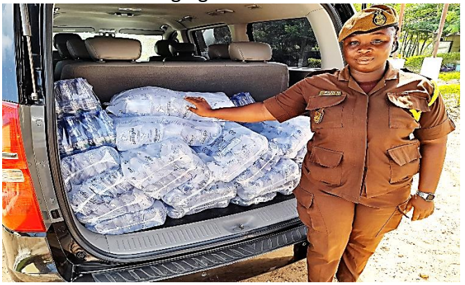
Many Christmas Gifts For Prisoners In Ghana