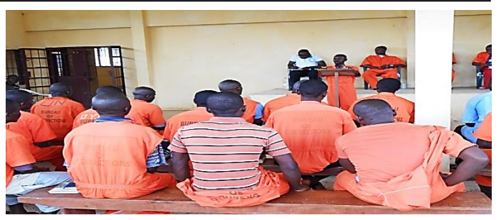
Sharing The gospel With Prisoners In Liberia