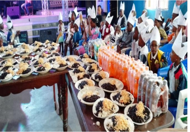
A Great Christmas Meal For Orphans In The DRC From GIMI