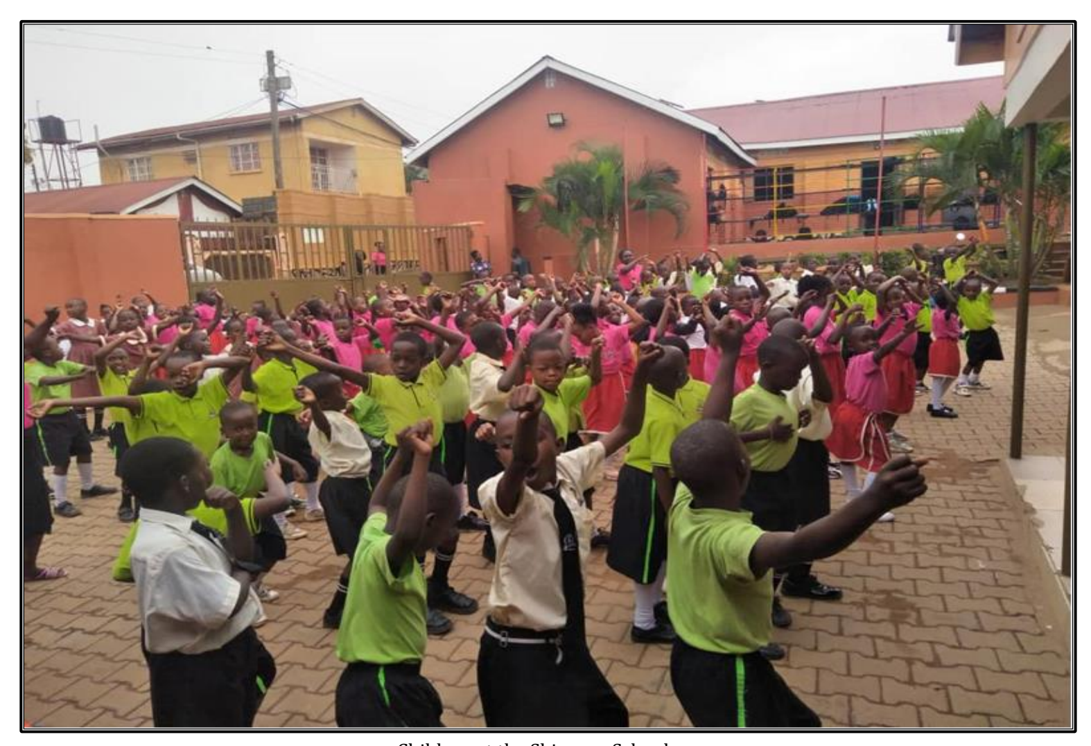
Children at the Shiperoy School Singing and Exercising. Shiperoy School is one of the schools GIMI supports in Uganda