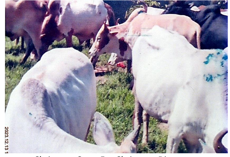
Christmas Cows For Christmas Dinner In Prisons From GIMI