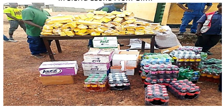
Many Gifts For Sierra Leone Prisoners For Christmas From GIMI