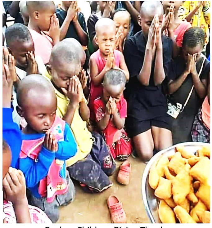
Orphan Children Giving Thanks For The Meal Given from GIMI