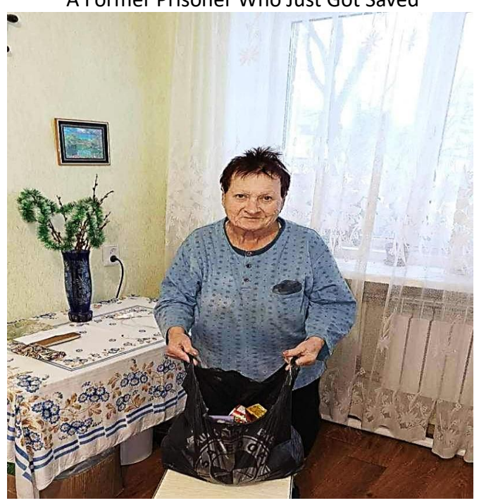
Precious Lady Getting Some Food From Grace Church During War