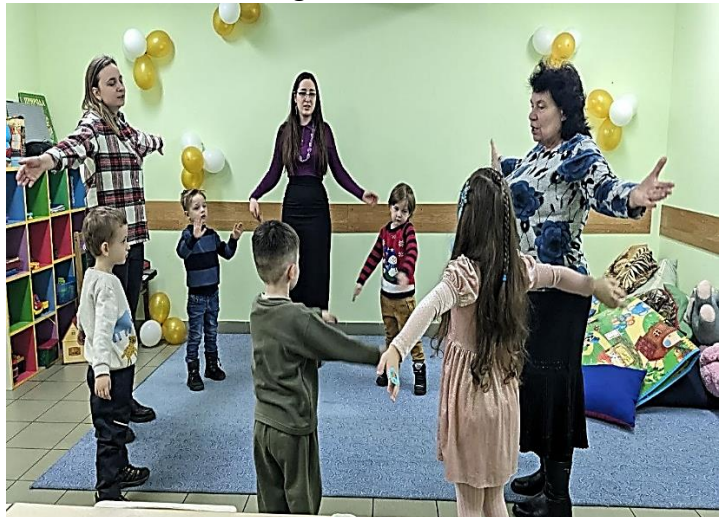
More Children In Sunday School At Grace Church With War Outside