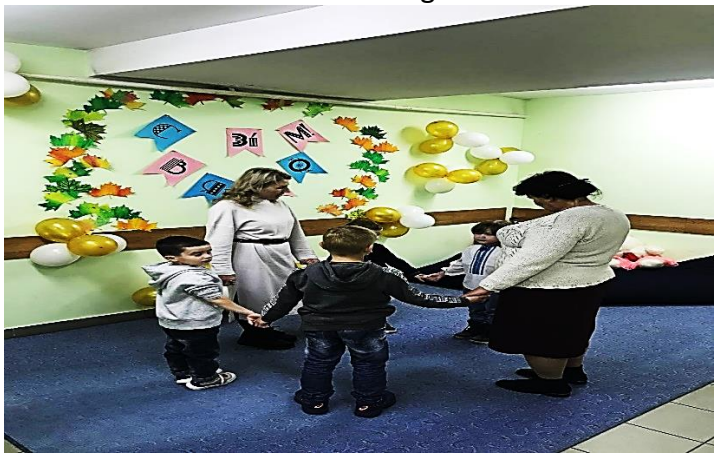
Children Enjoying Sunday School Even During The War Outside