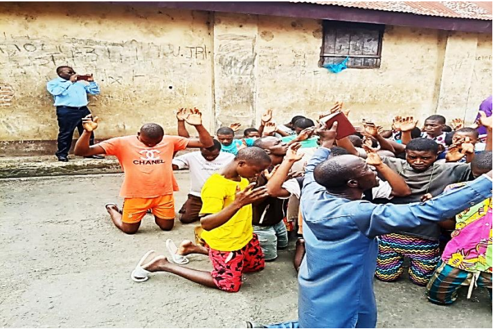
More Prisoners Getting Saved In A Cameroon Prison