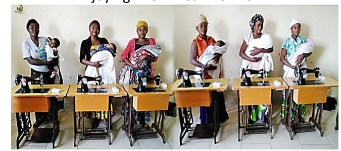
More Sewing Machines For Young Mothers To Support Their Kids From GIMI