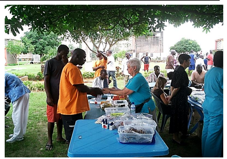
A Past GIMI Medical Clinic In A Prison In Ghana