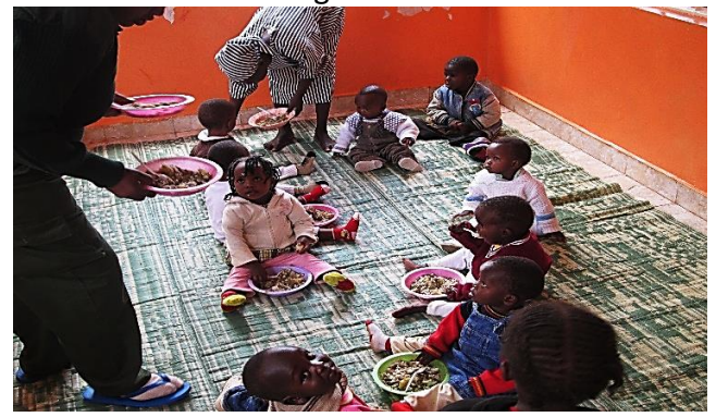
Feeding More Precious Orphans In The DR Congo