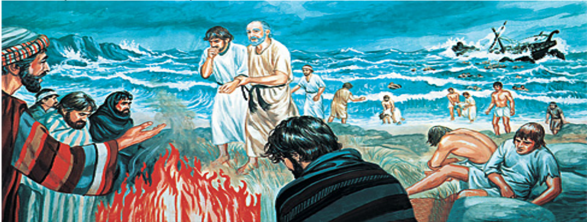
Paul And The Others Arriving On The Island From The Sea

The sailors, soldiers, prisoners, and everyone on the ship floated onto the shore on the Island of Malta safely just as the angel had promised. God showed His marvelous grace one more time, even if these wicked and defiant people rejected the message of Paul way back there in the Fair Havens. We should let this story remind us of the goodness of God to all of us. Although we all are fallen sinners, God's amazing grace and love have been extended to us so that we can be forgiven of our sins, and yes, ultimately rich our heavenly destination.