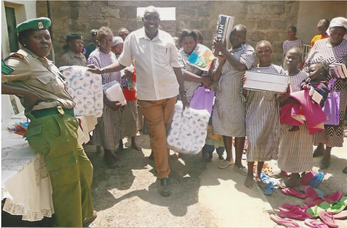
Christmas Gifts For Kenya Lady Prisoners