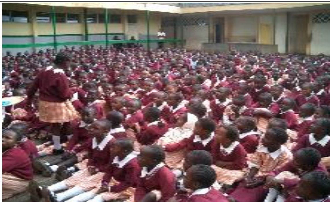
Madaraka School In Nairobi