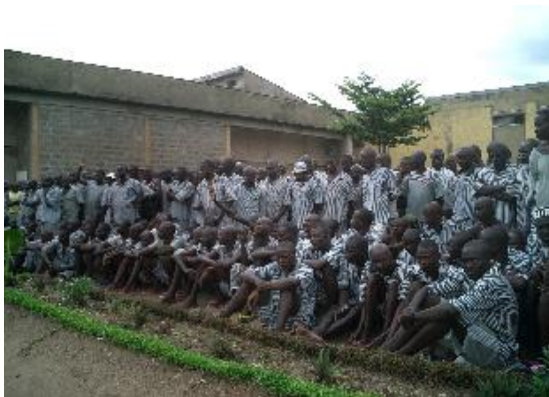
Kenya CONDEMNED PRISONERS