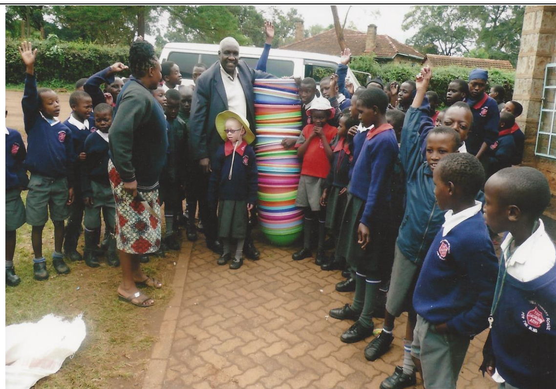
GIMI Gifts For Kenya Blind Children