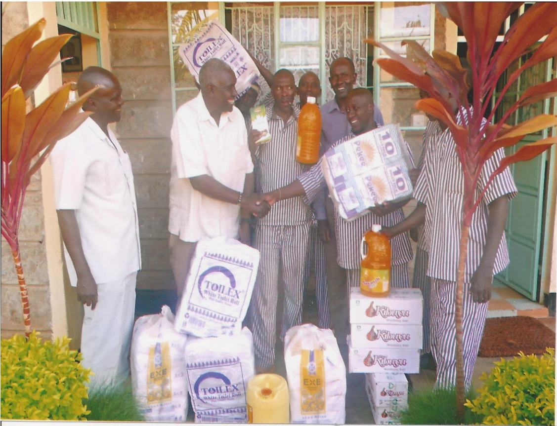
Christmas Gifts For Kenya Men Prisoners