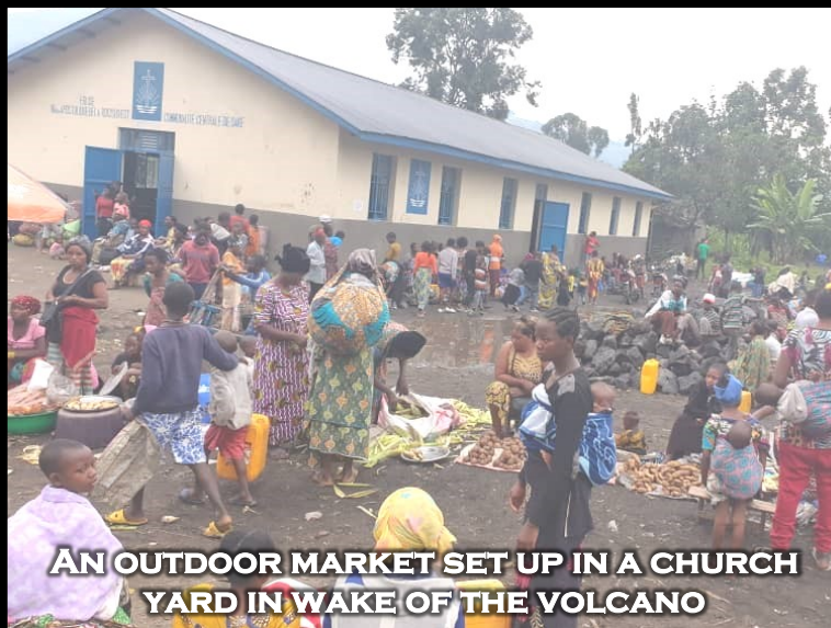
AN OUTDOOR MARKET SET UP IN A CHURCH YARD IN WAKE OF THE VOLCANO