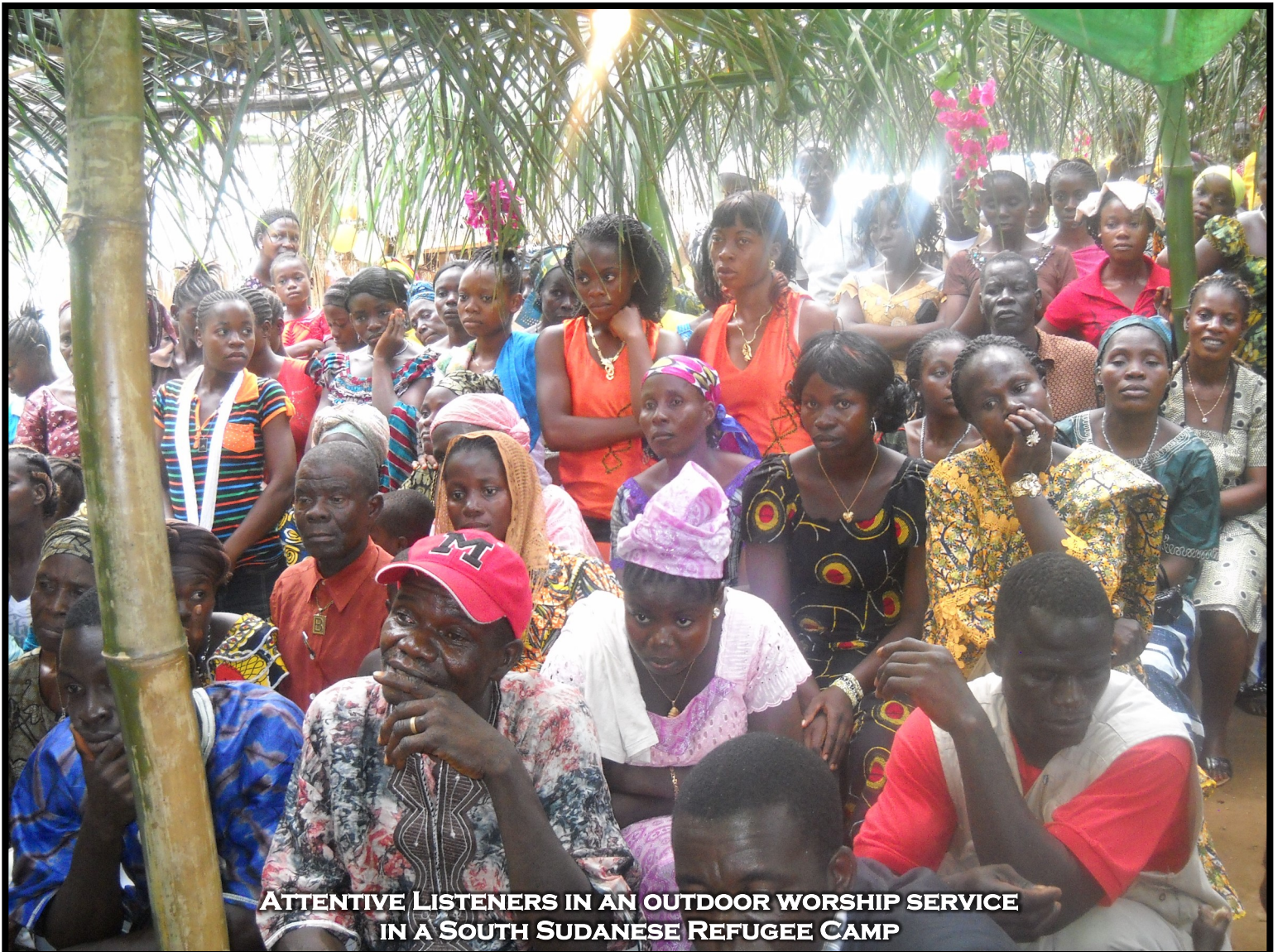
ATTENTIVE LISTENERS IN AN OUTDOOR WORSHIP SERVICE IN A SOUTH SUDANESE REFUGEE CAMP