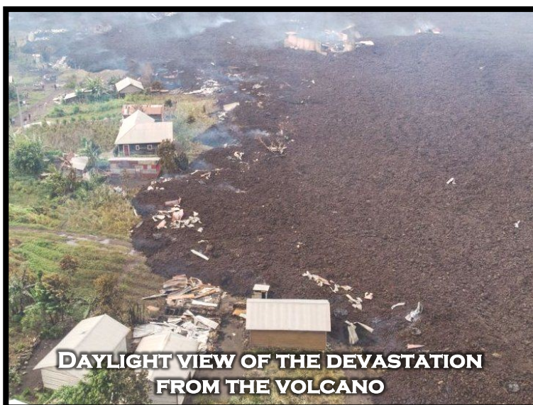
DAYLIGHT VIEW OF THE DEVASTATION FROM THE VOLCANO

such vile wickedness in the lives of our so-called leaders. I won't mention any names this time, but all one has to do is to look at the news on a conservative station like Fox News each day. If you are a believer in Christ, you can't help but believe that these wicked, hypocritical leaders are hell-bent on destroying this great land. Satan has corrupted almost our entire governmental system in Washington, D.C., and he has done likewise in so many communities, counties, states, and cities here in America. Never would I have ever dreamed that before I die, I would see the terrible demise of the greatest nation that has ever existed on earth. I literally weep when I think about what our grandchildren, especially our two new beautiful great-grandsons and our brand new great-granddaughter, are going to face in this nation if Jesus doesn't return very soon. These precious children will be persecuted for their Christian faith, and no doubt, many believers will have to go to jail, while some may even have to die as martyrs for their faith if there is not a spiritual awakening.