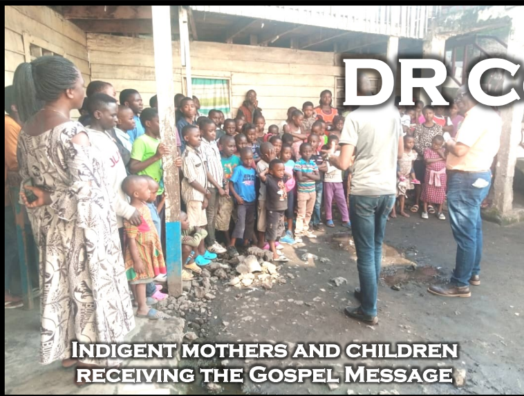
INDIGENT MOTHERS AND CHILDREN RECEIVING THE GOSPEL MESSAGE