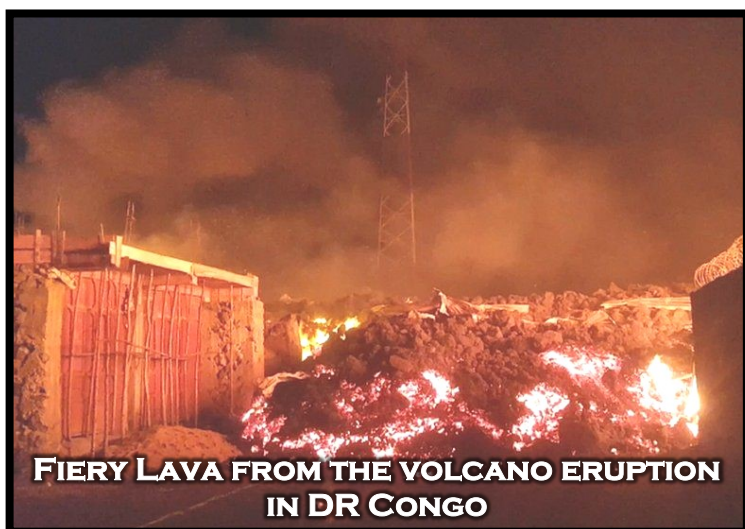
FIERY LAVA FROM THE VOLCANO ERUPTION IN DR CONGO