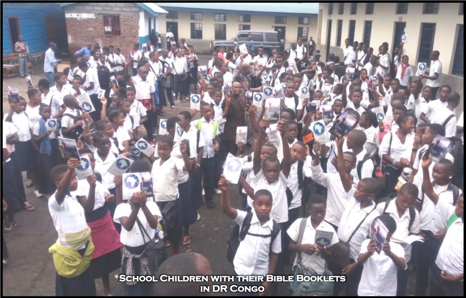
SCHOOL CHILDREN WITH THEIR BIBLE BOOKLETS IN DR CONGO