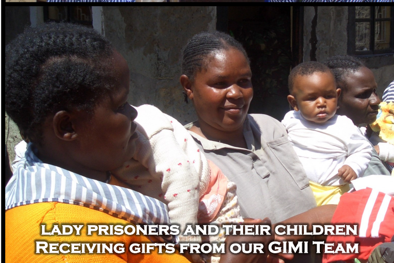
LADY PRISONERS AND THEIR CHILDREN RECEIVING GIFTS FROM OUR GIMI TEAM