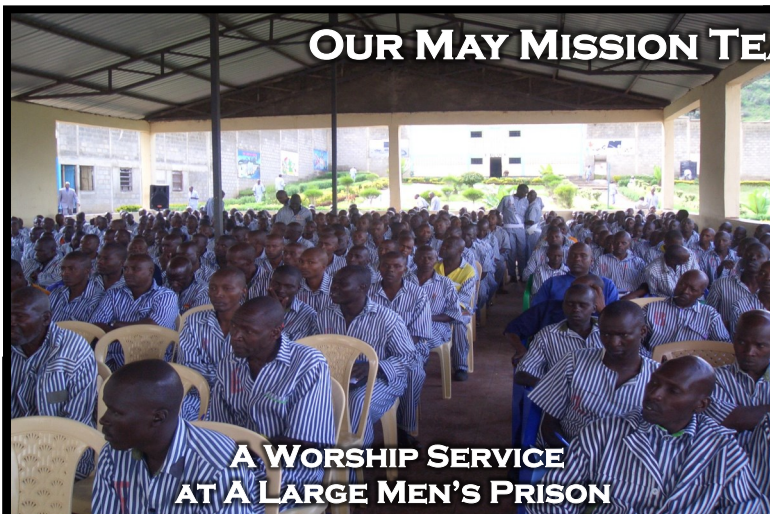
A WORSHIP SERVICE AT A LARGE MEN'S PRISON