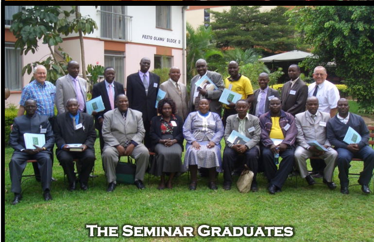
THE SEMINAR GRADUATES