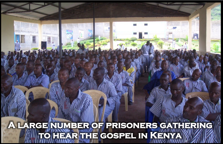
A LARGE NUMBER OF PRISONERS GATHERING TO HEAR THE GOSPEL IN KENYA