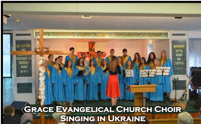
GRACE EVANGELICAL CHURCH CHOIR SINGING IN UKRAINE