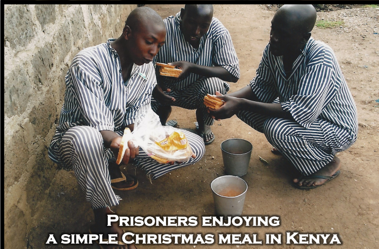
PRISONERS ENJOYING A SIMPLE CHRISTMAS MEAL IN KENYA