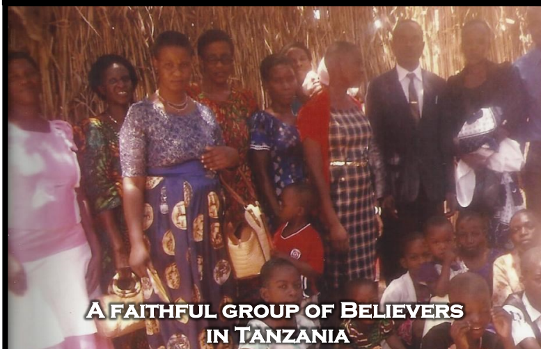
A FAITHFUL GROUP OF BELIEVERS IN TANZANIA