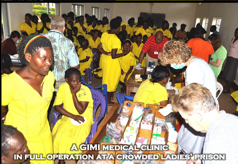
A GIMI MEDICAL CLINIC IN FULL OPERATION AT A CROWDED LADIES' PRISON