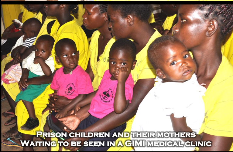
PRISON CHILDREN AND THEIR MOTHERS WAITING TO BE SEEN IN A GIMI MEDICAL CLINIC