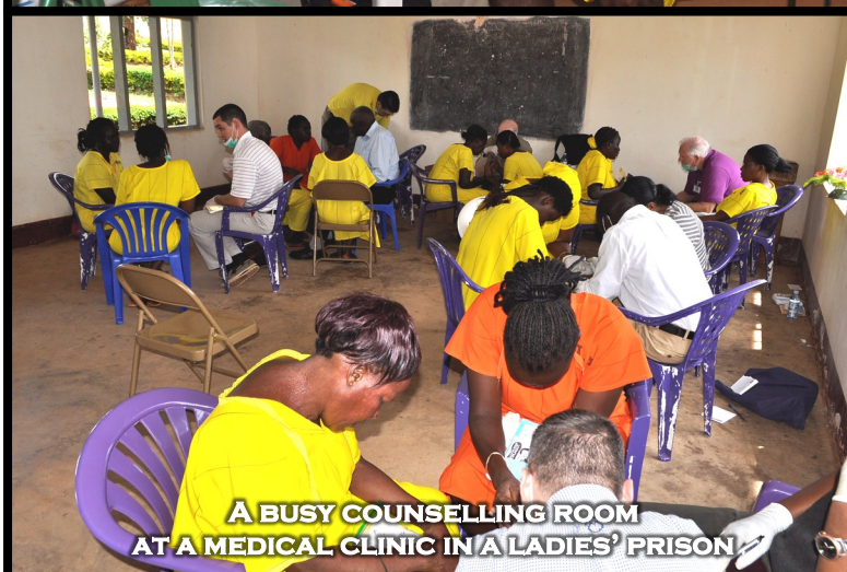
A BUSY COUNSELLING ROOM AT A MEDICAL CLINIC IN A LADIES' PRISON