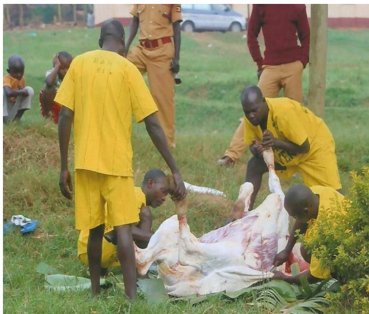
Prisoners Dressing A GIMI Christmas Cow Last Year