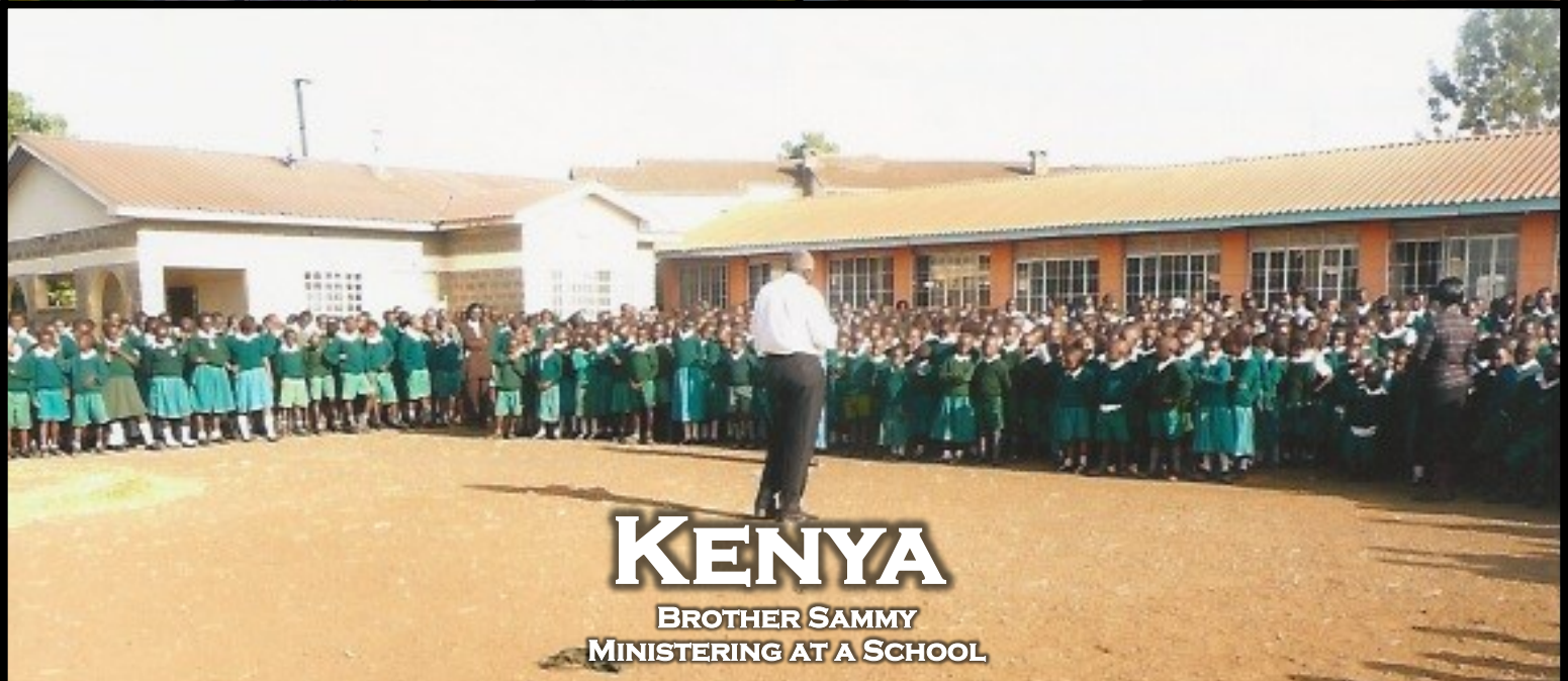
KENYA BROTHER SAMMY MINISTERING AT A SCHOOL