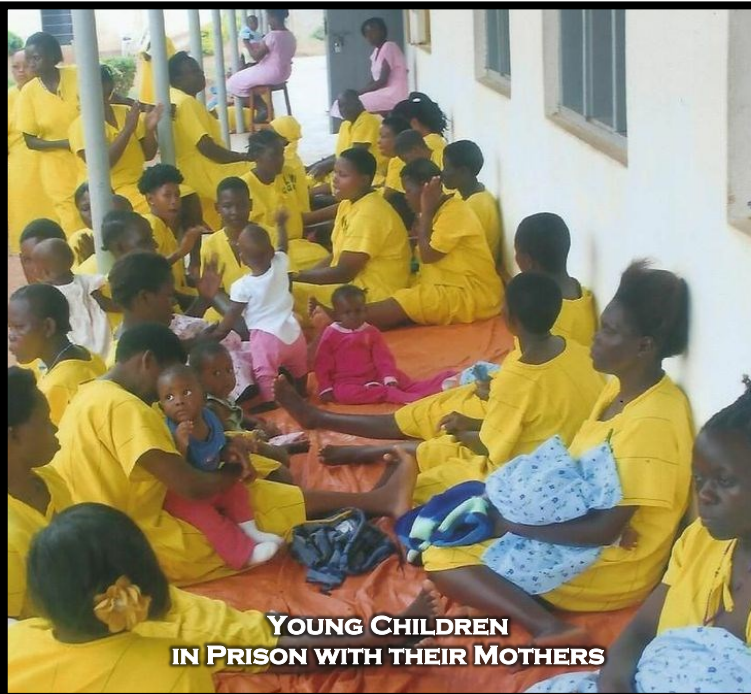
YOUNG CHILDREN IN PRISON WITH THEIR MOTHERS