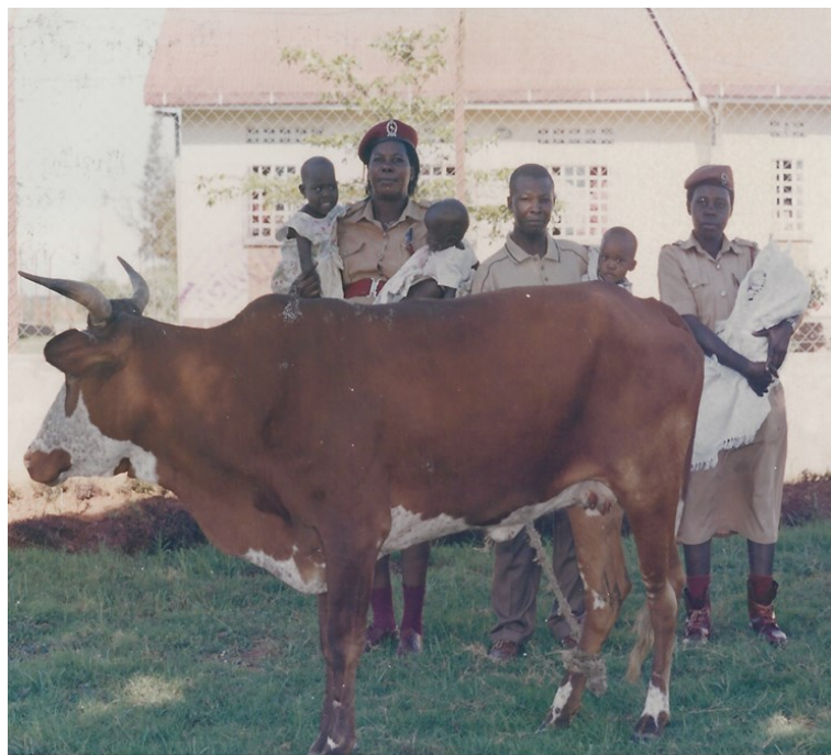
Prison Officers and Prison Children with A GIMI Christmas Cow 2016

needed food for these greatly neglected people on Christmas Day. Again, thanks for what you have already given and for those of you who may still help us reach our goal of $10,000 for the purchase of 40 cows. Just remember, it will not be long until Christmas, and we need your help soon!