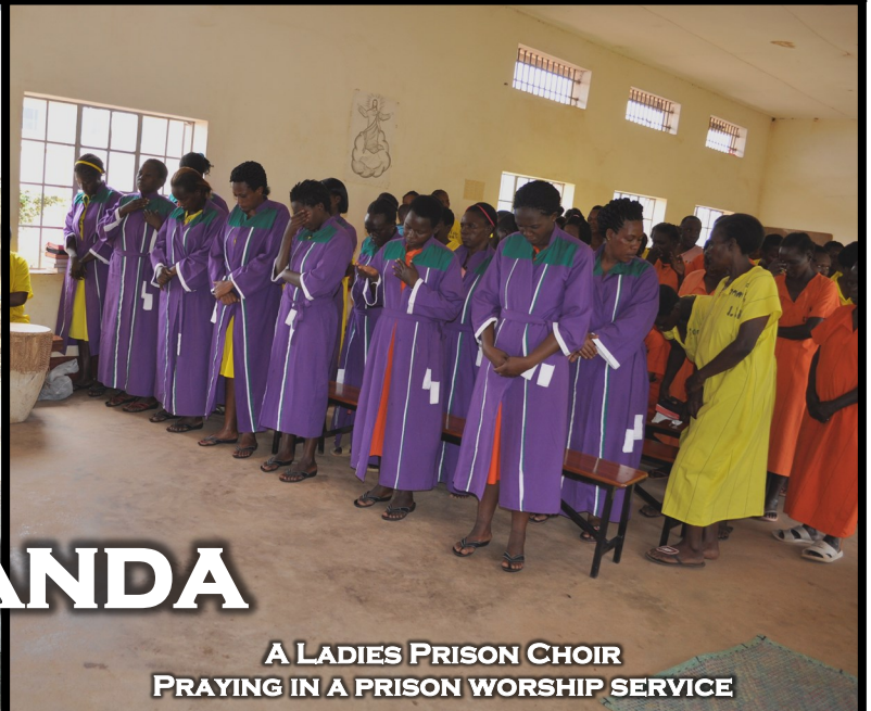
A LADIES PRISON CHOIR PRAYING IN A PRISON WORSHIP SERVICE