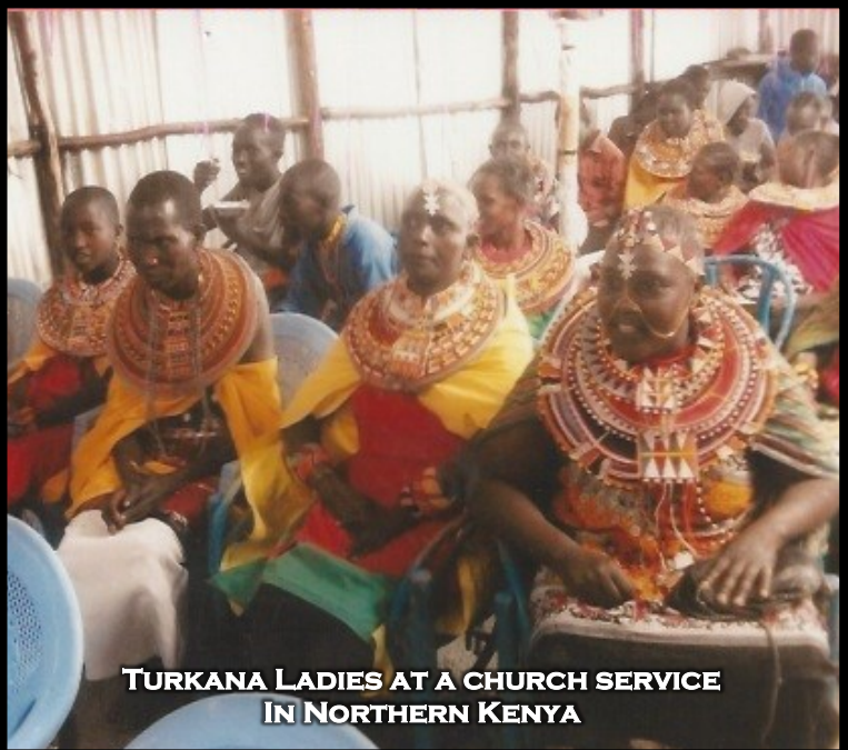
TURKANA LADIES AT A CHURCH SERVICE IN NORTHERN KENYA