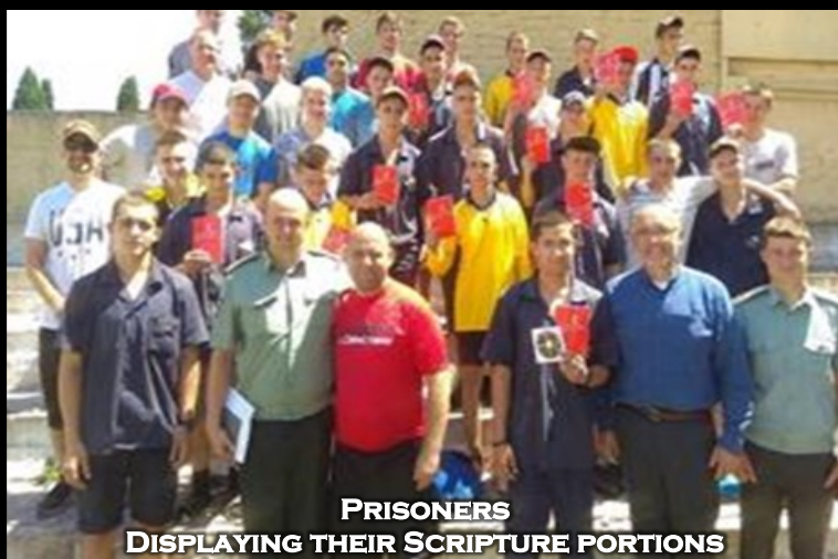
PRISONERS DISPLAYING THEIR SCRIPTURE PORTIONS