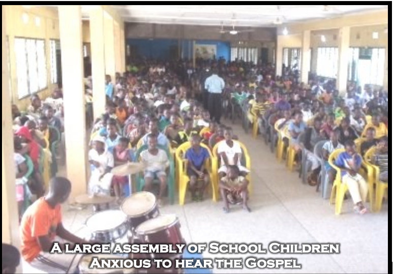
A LARGE ASSEMBLY OF SCHOOL CHILDREN ANXIOUS TO HEAR THE GOSPEL