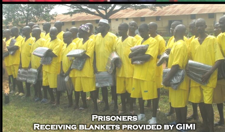
PRISONERS RECEIVING BLANKETS PROVIDED BY GIMI