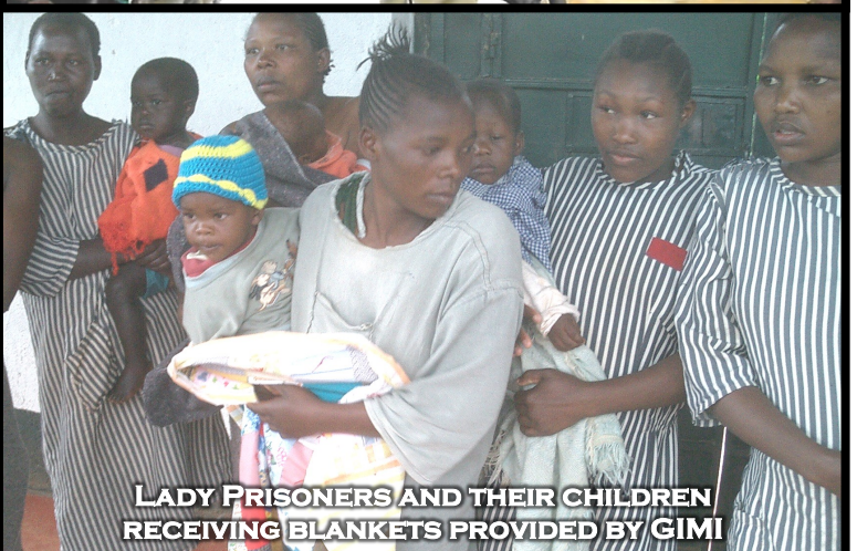
LADY PRISONERS AND THEIR CHILDREN RECEIVING BLANKETS PROVIDED BY GIMI