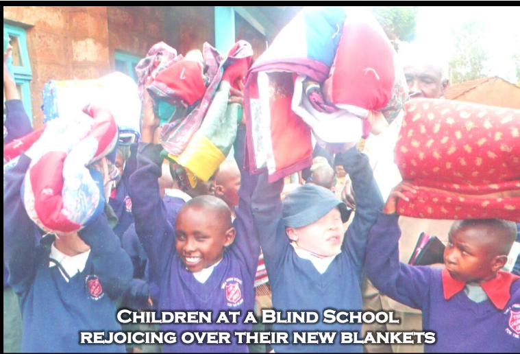
CHILDREN AT A BLIND SCHOOL REJOICING OVER THEIR NEW BLANKETS