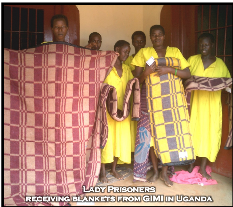
LADY PRISONERS RECEIVING BLANKETS FROM GIMI IN UGANDA

Our goal is to eventually buy 10,000 blankets at the cost of $10.00 each, which will bring the total funds needed to $100,000. I want to thank many of you who have already helped toward this project, but I would like to encourage more of you to help us provide this warmth for a lot of cold suffering people in African prisons. We have provided some really good photos of some of the distribution of the blankets in Kenya and Uganda. We sincerely hope that these photos showing the excitement of the people when they receive these blankets will inspire you to help us raise all the funds we need. And, I would remind you that with every blanket we distribute, we give the Gospel message so that the people can also be covered by the blood of Jesus in order to wash away their sins and to cover their spiritual nakedness. I would appeal to all of you to please help us share the warmth of God's amazing love with these suffering people!