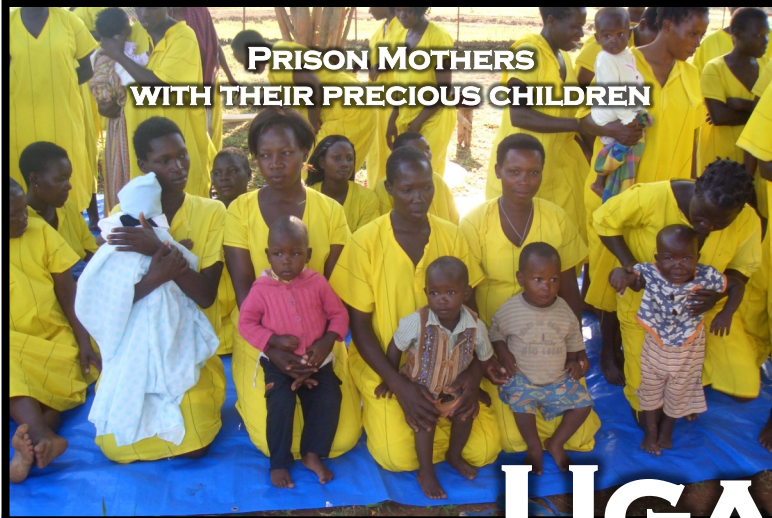
PRISON MOTHERS WITH THEIR PRECIOUS CHILDREN