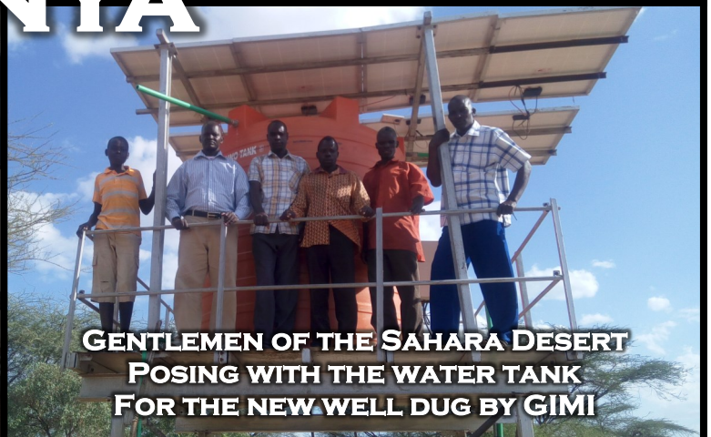
GENTLEMEN OF THE SAHARA DESERT POSING WITH THE WATER TANK FOR THE NEW WELL DUG BY GIMI