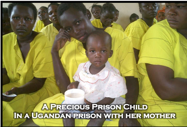
A PRECIOUS PRISON CHILD IN A UGANDAN PRISON WITH HER MOTHER