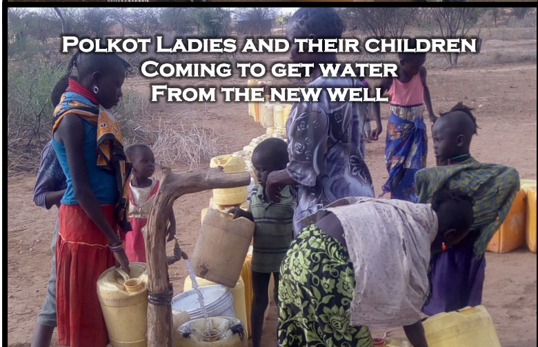
POLKOT LADIES AND THEIR CHILDREN COMING TO GET WATER FROM THE NEW WELL