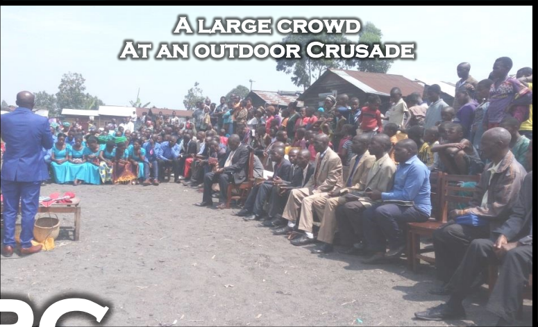
A LARGE CROWD AT AN OUTDOOR CRUSADE