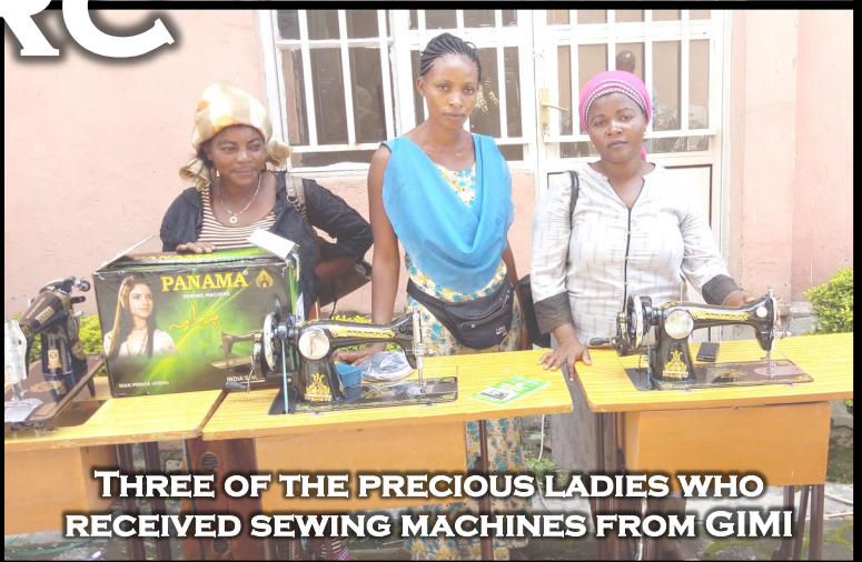
THREE OF THE PRECIOUS LADIES WHO RECEIVED SEWING MACHINES FROM GIMI