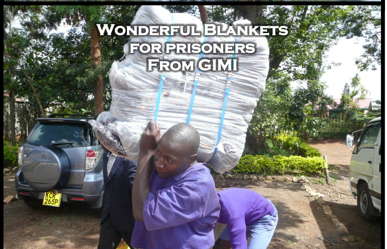
WONDERFUL BLANKETS FOR PRISONERS FROM GIMI