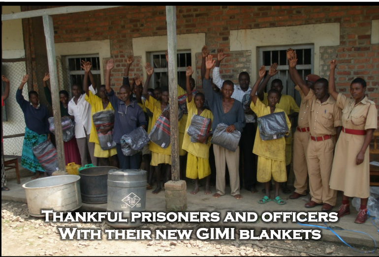
THANKFUL PRISONERS AND OFFICERS WITH THEIR NEW GIMI BLANKETS