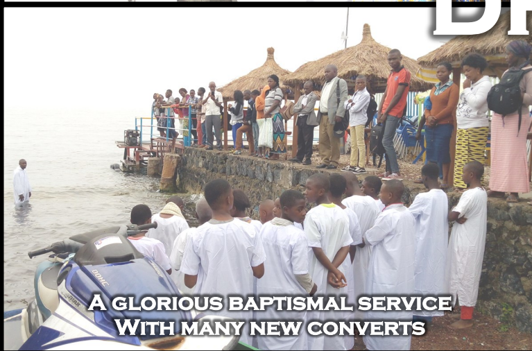
A GLORIOUS BAPTISMAL SERVICE WITH MANY NEW CONVERTS