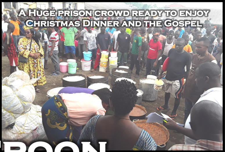
A HUGE PRISON CROWD READY TO ENJOY CHRISTMAS DINNER AND THE GOSPEL