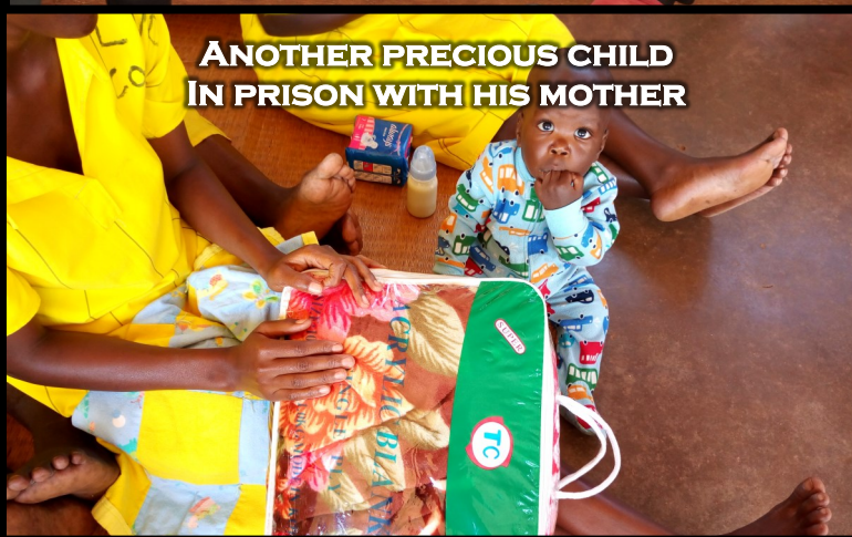
ANOTHER PRECIOUS CHILD IN PRISON WITH HIS MOTHER