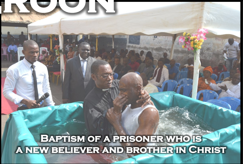
BAPTISM OF A PRISONER WHO IS A NEW BELIEVER AND BROTHER IN CHRIST