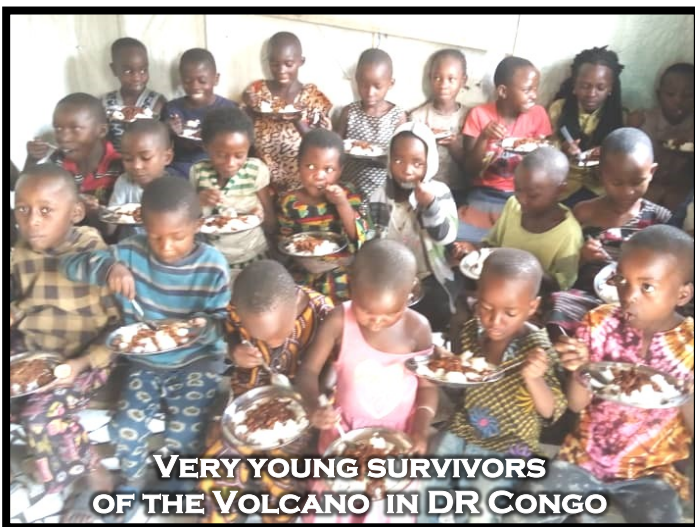
VERY YOUNG SURVIVORS OF THE VOLCANO IN DR CONGO