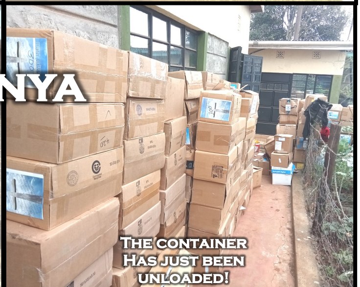
THE CONTAINER HAS JUST BEEN UNLOADED!