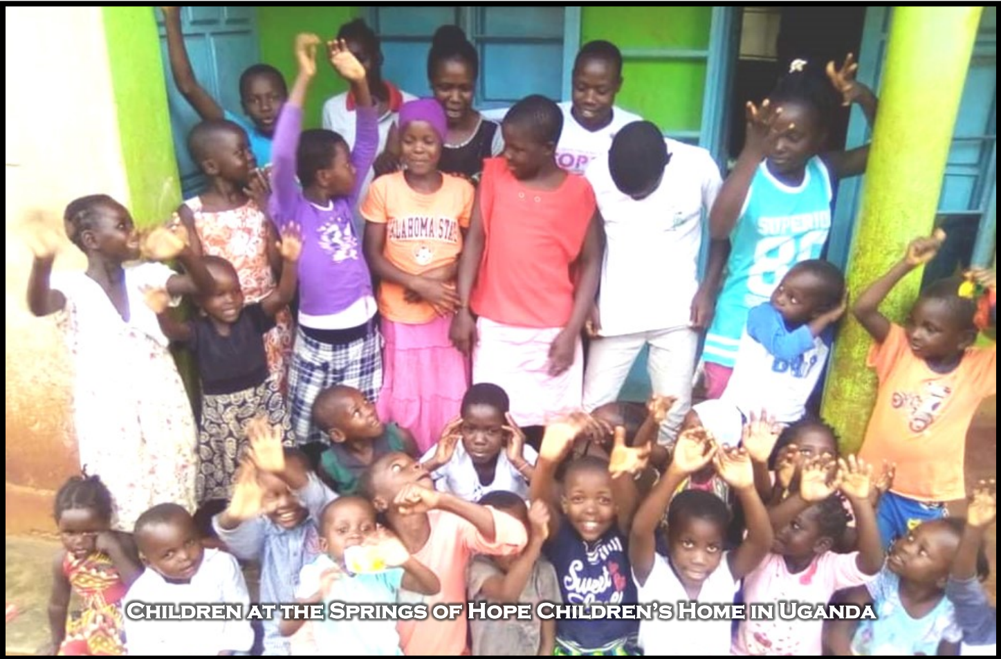
CHILDREN AT THE SPRINGS OF HOPE CHILDREN'S HOME IN UGANDA