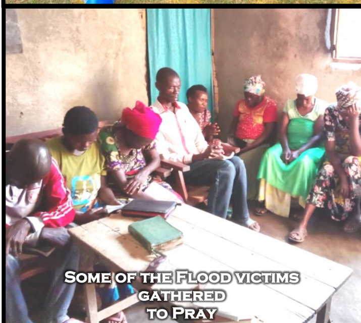
SOME OF THE FLOOD VICTIMS GATHERED TO PRAY