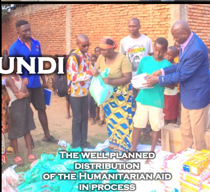
THE WELL PLANNED DISTRIBUTION OF THE HUMANITARIAN AID IN PROCESS