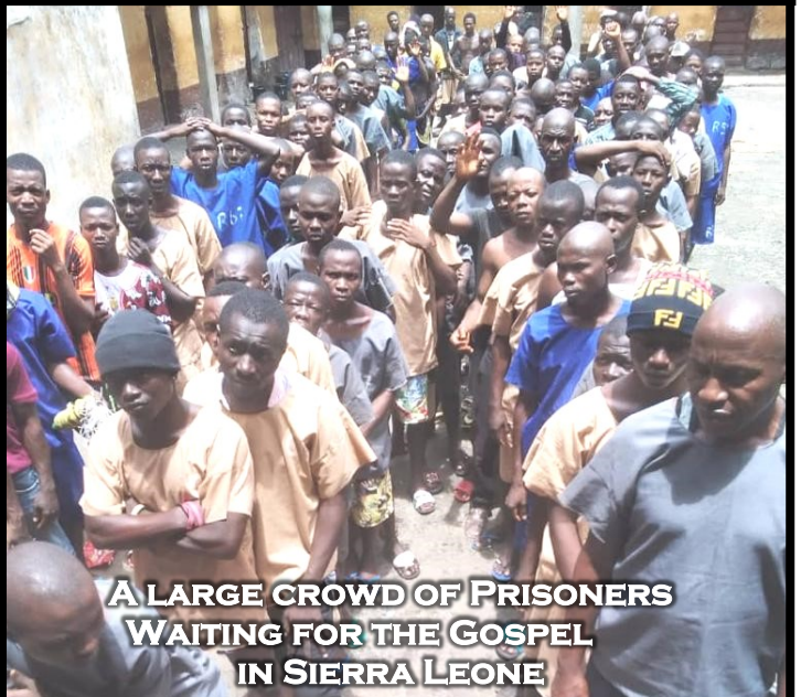
A LARGE CROWD OF PRISONERS WAITING FOR THE GOSPEL IN SIERRA LEONE