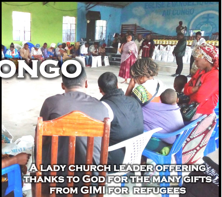
A LADY CHURCH LEADER OFFERING THANKS TO GOD FOR THE MANY GIFTS FROM GIMI FOR REFUGEES