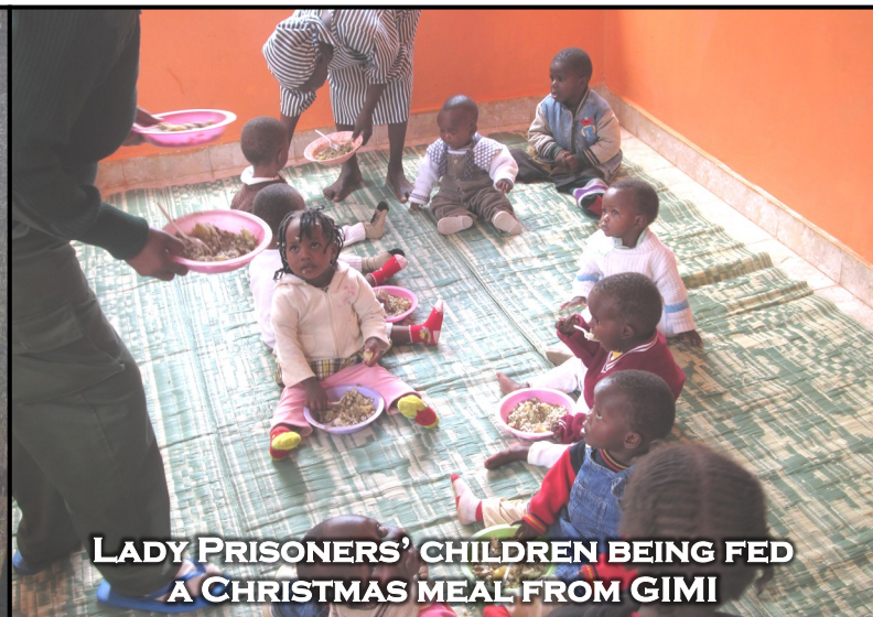
LADY PRISONERS' CHILDREN BEING FED A CHRISTMAS MEAL FROM GIMI