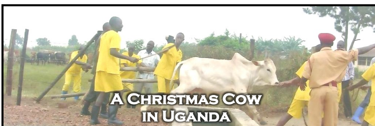
A CHRISTMAS COW IN UGANDA